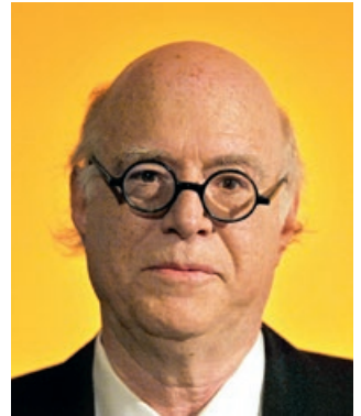
Prof. Richard Sennett, Prize Recipient 2008