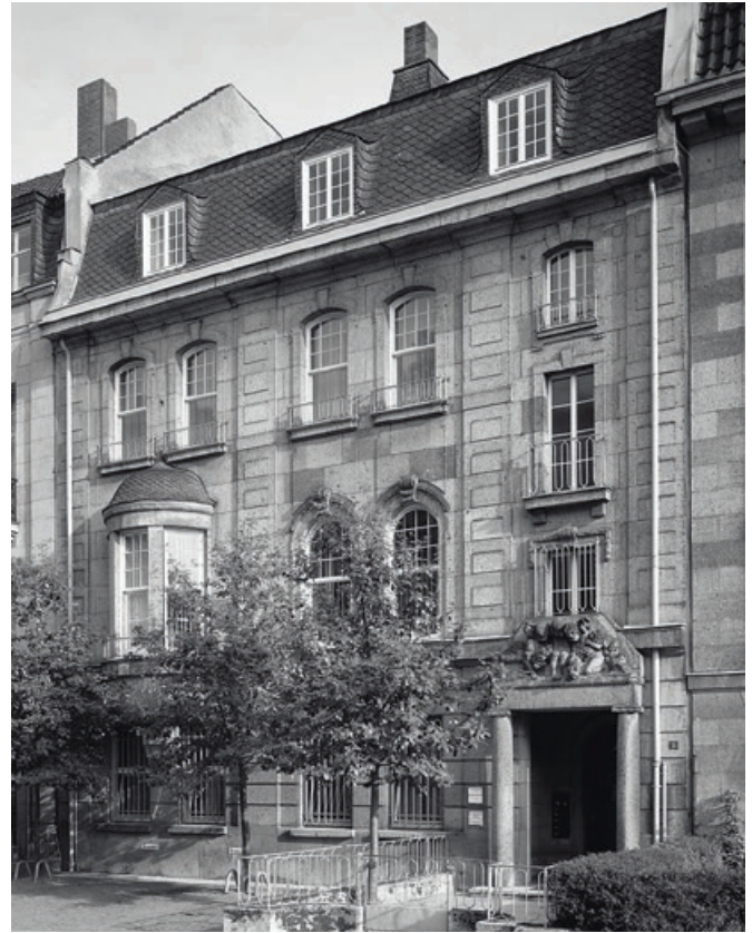
The Foundation's building in Düsseldorf

The Gerda Henkel Foundation has supported research in the historical humanities since its founding in 1976. In 40 years, the Foundation has supported over 6,600 research projects to the tune of about 160 million euros.